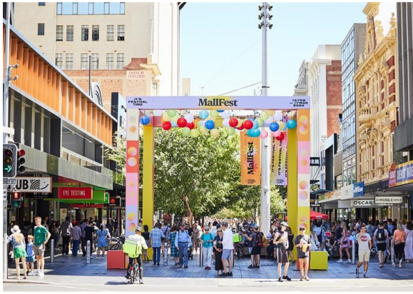
Rundle Mall Activations

Throughout the quarter a range of activations have been delivered in the Rundle Mall precinct increasing vibrancy and driving foot traffic and spend, including: