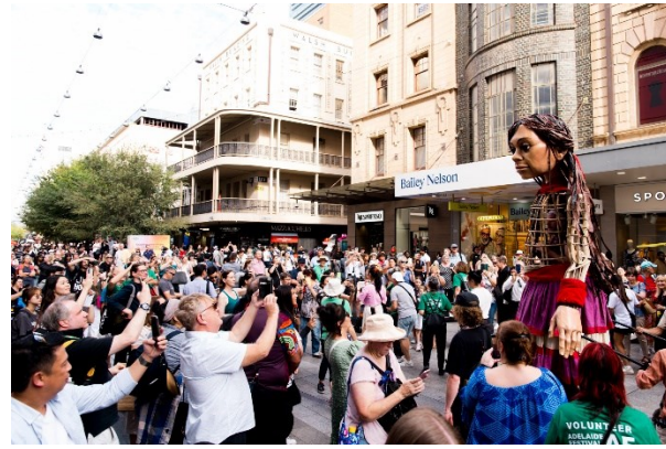
Rundle Mall Foot Traffic

Lunar New Year celebrated the Year of the Dragon. Rundle Mall activated the Precinct with traditional lion dances every hour, on the hour, from 12 pm to 6 pm on Friday 16 February.